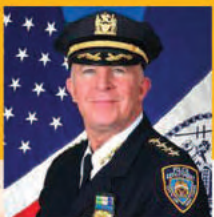
-NYPD Commissioner James O'Neill at the 2016 Law Enforcement Academy Graduation One Police Plaza

"You made the choice to improve yourself and to learn about your community – our city. We are counting on you to be ambassadors for the Exploring program and role models for your peers."