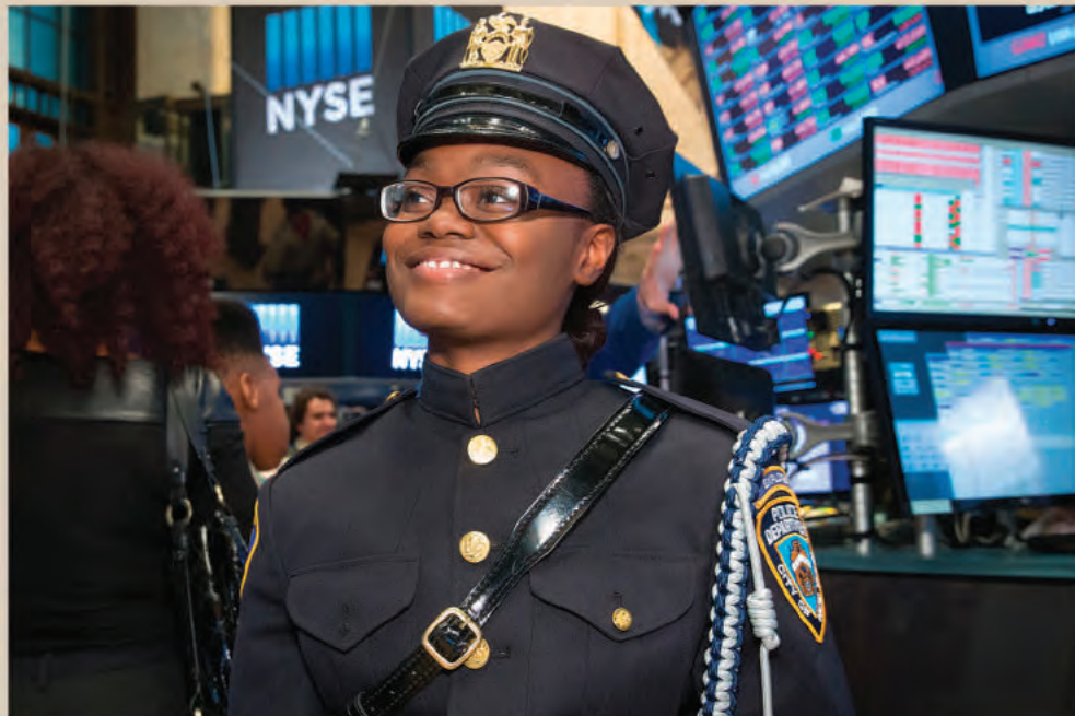
Law Enforcement Explorer at the NYSE

Academy: Over 230 young men and women participated in the three-week academy, which brings students to classrooms at Fordham University for two weeks and to Camp Keowa for one week of drills, scenarios, zip lining, ropes courses, and other outdoor adventures in upstate New York. The Academy culminated in a graduation ceremony at One Police Plaza hosted by the NYPD.