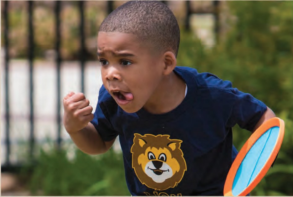
A roaring Lion Scout with his game face on.

>> New Lions Program: In 2016, 228 young boys were introduced to Scouting. It has been a “roaring” success. Kindergarten-aged boys are very eager to explore the outdoors, venture off, and make new friends. It’s still a bright, new world full of curiosity for them, and we’re here to teach them how to maneuver through it. Lions recruitment to the Cub Scouts has been a tremendous success. At this young, extremely impressionable age, our Lions are learning new skills, developing great early teamwork attributes and implementing them all while having the time of their lives!