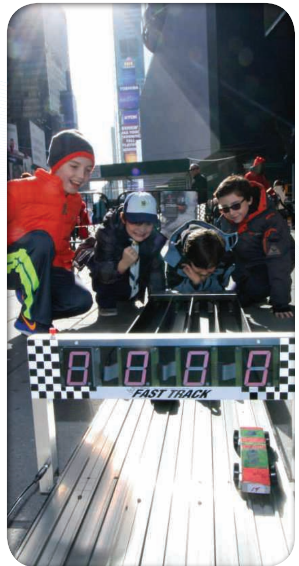
Front Cover Photo: Our Scouts marching in the 2014 Veteran's Day Parade and Scouts & Explorers learning new skills. Above Photo: Scouts at Pinewood Derby in Times Square