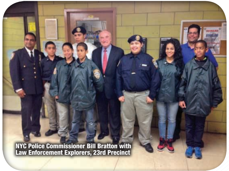
NYC Police Commissioner Bill Bratton with Law Enforcement Explorers, 23rd Precinct

Executive Vice President, Rudin Management Company