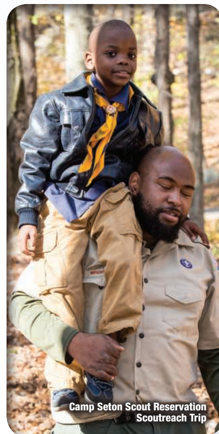
Camp Seton Scout Reservation Scoutreach Trip