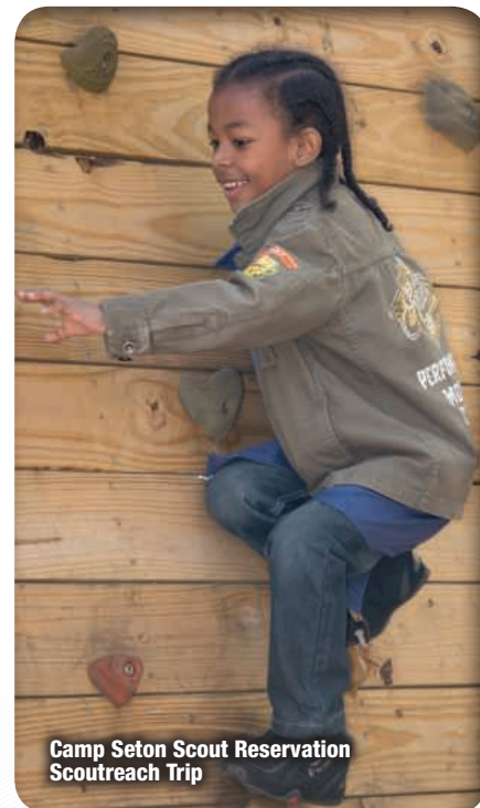
Camp Seton Scout Reservation Scoutreach Trip

James E. West Fellows have made a minimum contribution of $1,000 to the Councils Permanent Endowment Fund. These dollars are held for the perpetual benefit of Scouting in New York City.