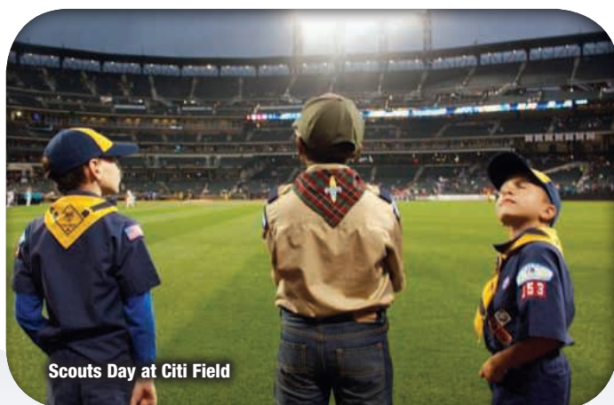
Scouts Day at Citi Field