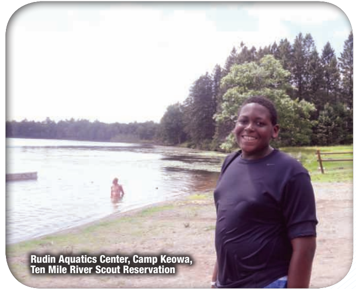
Rudin Aquatics Center, Camp Keowa, Ten Mile River Scout Reservation