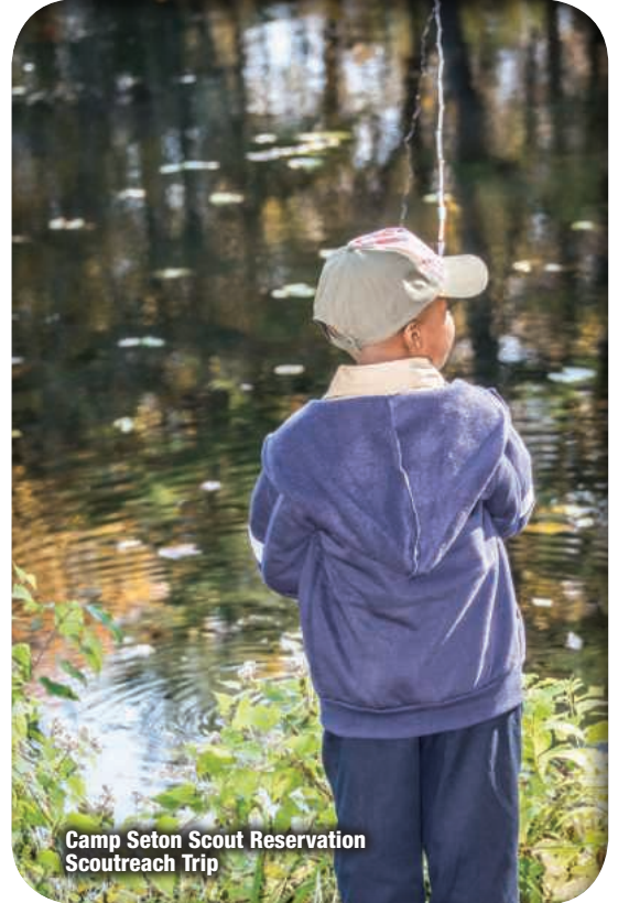
Camp Seton Scout Reservation Scoutreach Trip