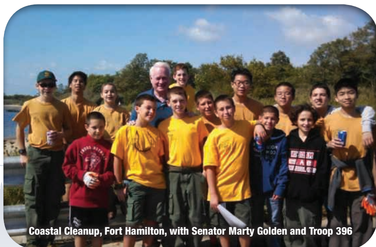
Coastal Cleanup, Fort Hamilton, with Senator Marty Golden and Troop 396