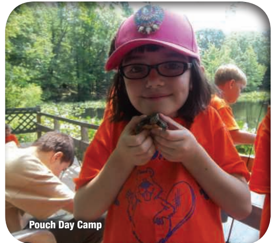
Pouch Day Camp

Greater New York Councils, BSA 350 Fifth Avenue, Suite 7820, New York, NY 10118 TEL: 212-242-1100 | FAX: 212-242-3630 www.bsa-gnyc.org