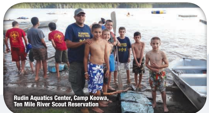
Rudin Aquatics Center, Camp Keowa, Ten Mile River Scout Reservation