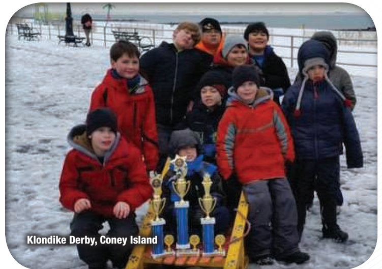
Klondike Derby, Coney Island

24. ENTERPRISE RENT-A-CAR FUND to permanently endow youth development, team-building programs and activities utilizing the great outdoors.