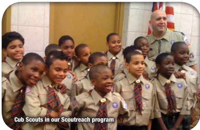
Cub Scouts in our Scoutreach program

Skadden, Arps, Slate, Meagher & FLoM LLP