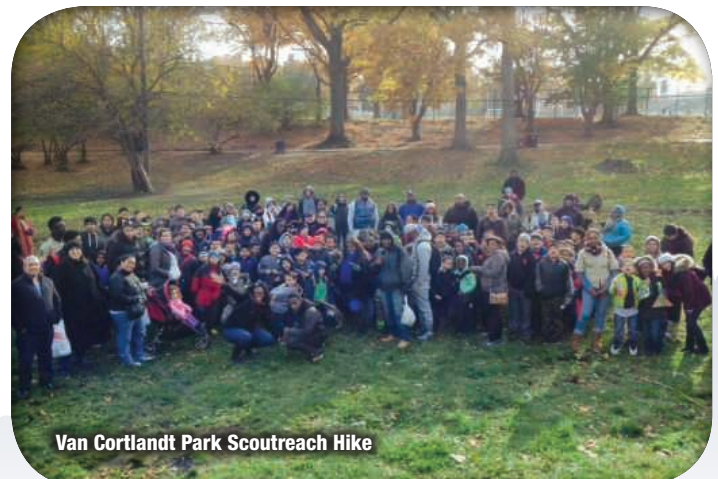
Van Cortlandt Park Scoutreach Hike