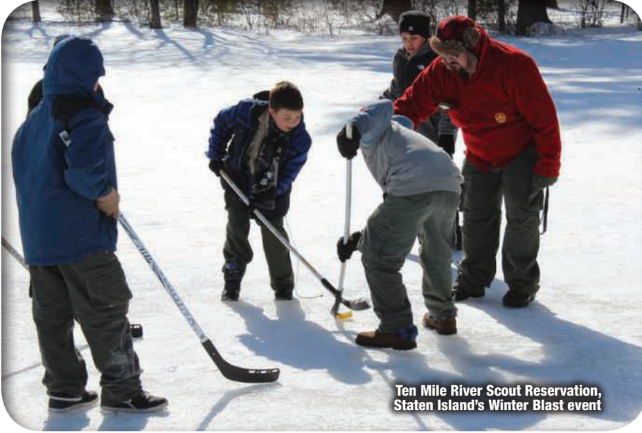
Ten Mile River Scout Reservation, Staten Island's Winter Blast event