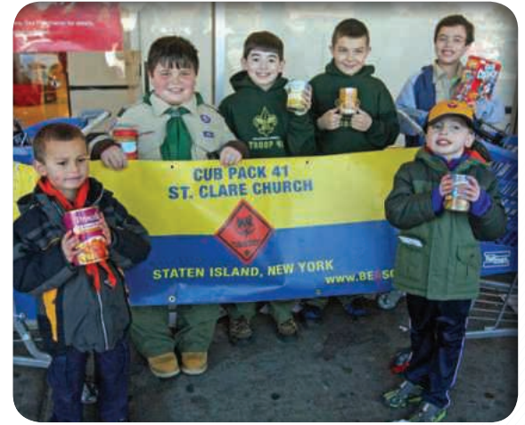
Above Photo: Scouting For Food

Our Mission: The Greater New York Councils, Boy Scouts of America has helped over five million young people become “Prepared for Life.” The mission of the Boy Scouts of America is to prepare young people to make ethical and moral choices. The vision of the Greater New York Councils is to serve kids and their families throughout the diverse communities of New York City and to help them to prepare for success in school, career, and life.