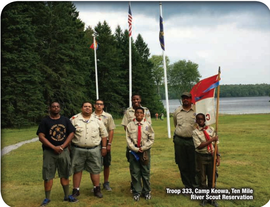
Troop 333, Camp Keowa, Ten Mile River Scout Reservation