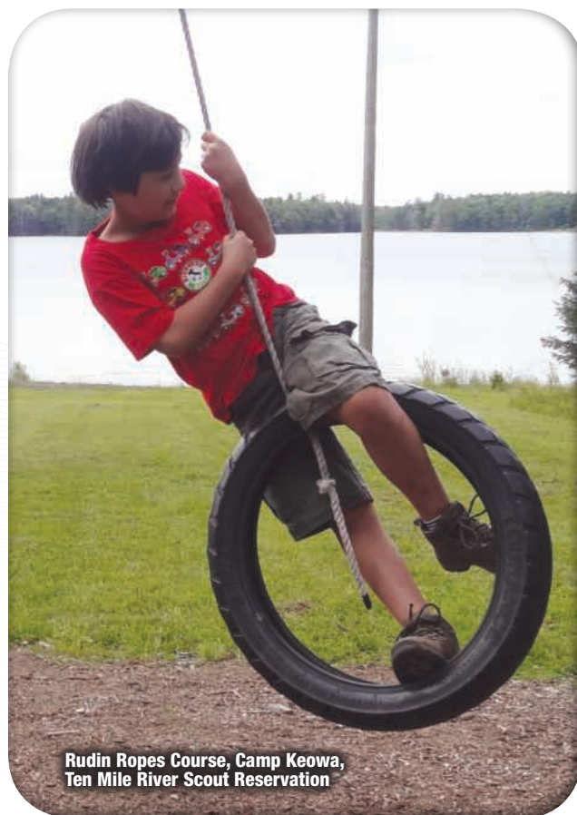
Rudin Ropes Course, Camp Keowa, Ten Mile River Scout Reservation