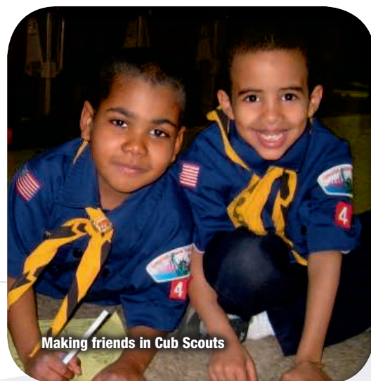
Making friends in Cub Scouts