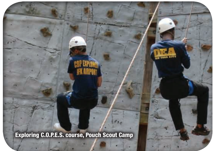
Exploring C.O.P.E.S. course, Pouch Scout Camp