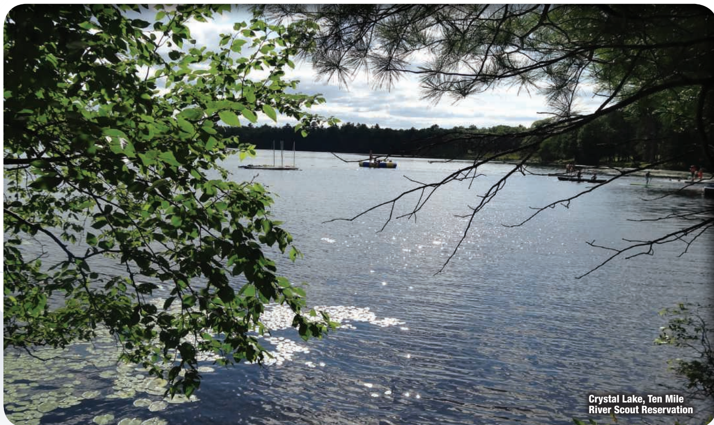
Crystal Lake, Ten Mile River Scout Reservation