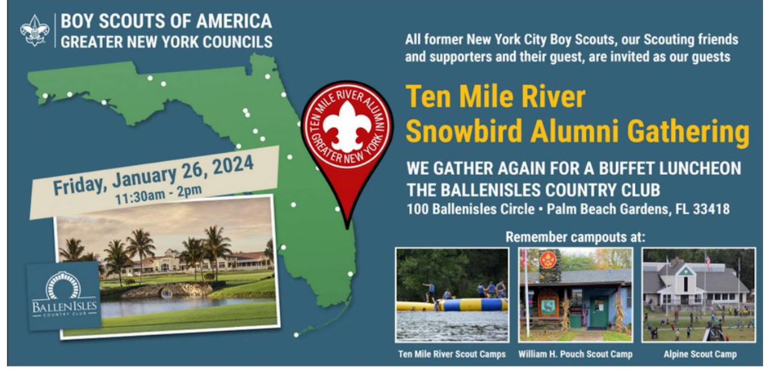
Register at: <a href="https://nycscouting.org/snowbird/">https://nycscouting.org/snowbird/</a>