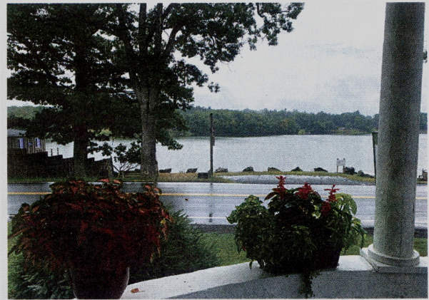
View from the Lower Deck at the Delaware Valley Opera Club in Lake Huntington

TEN MILE RIVER SCOUT MUSEUM hired a landscape architect to create a landscape masterplan (below) for the museum campus and grounds at the historic camp outside of Narrowsburg. The plans will guide the museum through a multiyear project to update, redesign, and landscape the property to improve the overall visitor experience.