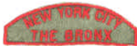
Kahki & Red Series - Boy Scouts

Only 25 42-patch sets will be manufactured. ORDER YOUR PATCH SET TODAY!