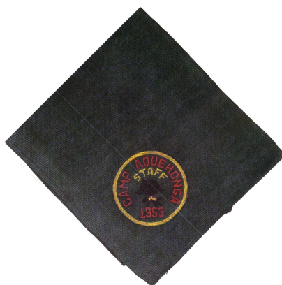
Fig. 3 - 1953 Aquehonga Staff Neckerchief

Another previously unlisted issue neckerchief has also recently surfaced. During the 1940's there were at least two TMR neckerchiefs issued. TMR was chain-stitched on standard BSAneckerchiefs. We knew that Purple and Brown varieties existed, but now a new color variation has surfaced. It is difficult to tell from the picture, but it is a very dark green (not black). The dark green color can be better seen (in the original) under natural light. (Figure 2.) Again any information of the provenance or other color examples please contact the author at bill@tenmilerivertrader.com