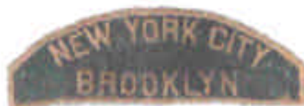
Green & Brown Series - Explorers

Order a patch set from our website: http://www.tnrmuseum.org We accept Paypal!