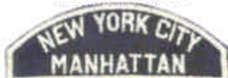
Blue & White Series - Sea Scouts (Winter)