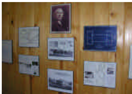
Reeves Lodge Display

and by various textile mills. Reeves Lodge was dedicated on April 4, 1948.