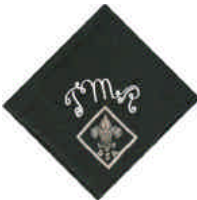
Fig. 2 - TMR Dark Green Neckerchief

Considering the source, I am inclined to believe it is genuine. I'd be interested in anyone with more information. (Figure 1.)