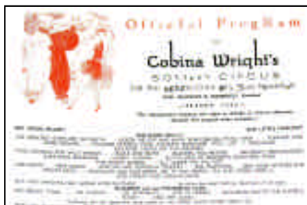
Cobina Wright's Society Circus Program

The East and West foyers of the ballroom featured some thirty-odd sideshow booths