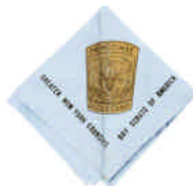
Fig. 5 - Camp Newcombe Neckerchief

Camp Aquehonga - 1949, 1959. Camp Davis Lake - 1959. Headquarters Camp - 1949, 1950, 1951, 1952, 1953, 1957, 1958. Camp Kernochan - 1954. Camp Man - 1952. Camp Ranachqua - 1949, 1950 Unit C, 1955. Camp Rondack - 1959.