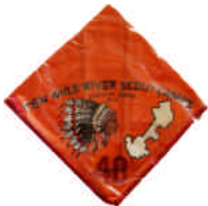
Fig. 1 - TMR 40th Anniversary Neckerchief

I'd like to start the column with a note that the Ten Mile River Scout Museum is gathering data for a second edition of the Guide to Memorabilia of the Ten Mile River Scout Camps. The original guide was published back in 2000. Since that time, there are 8 years of new issues plus a number of discoveries and previously unlisted/pictured items. If you have items which were not listed in the first edition of the guide, we would be interested in scans or pictures for inclusion in the second edition.