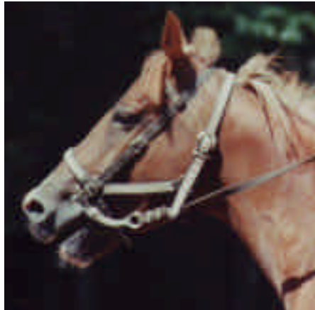
Actual Ponderosa Horse - Was this the one?