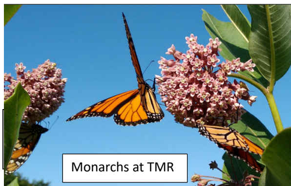
Monarchs at TMR