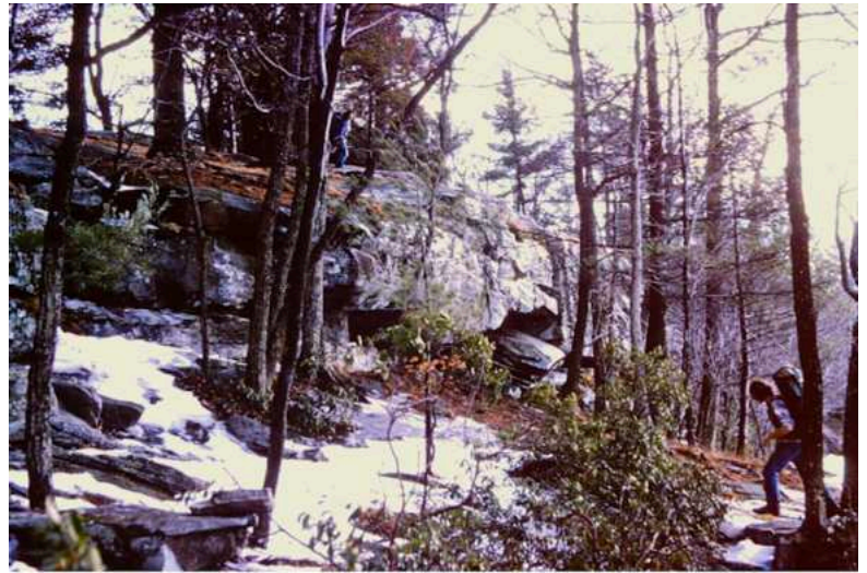
Michael Drilling on top of Eagle Rock and Kevin Powell below

The next morning we worked our way around Davis Lake to the site of Camp Hayden. Where the old heaterstack road intersects with the TMR Trail we found a wonderful rock outcrop on which was growing lots of rock tripe. We harvested some to cook later.