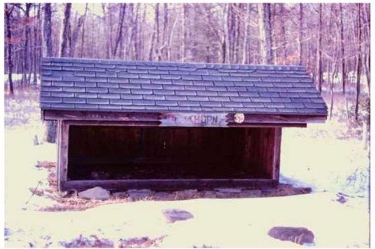
Buckhorn Trail Lean-to